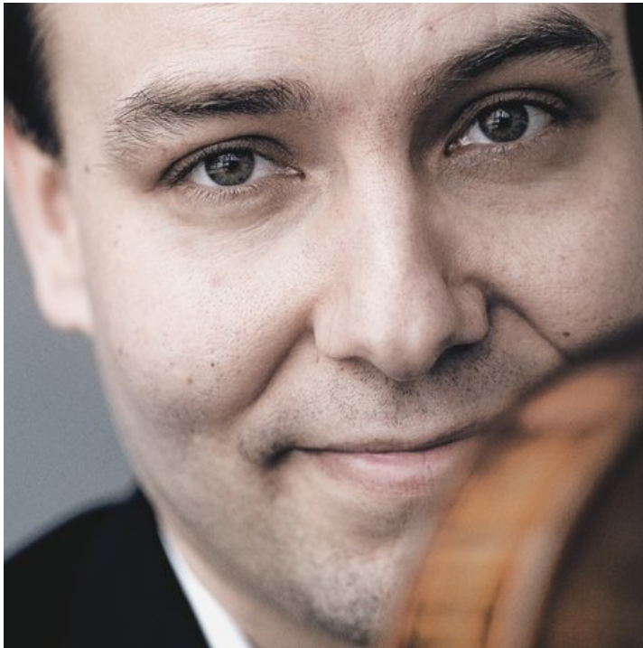
Born in Cracow Member since 2009-12-01