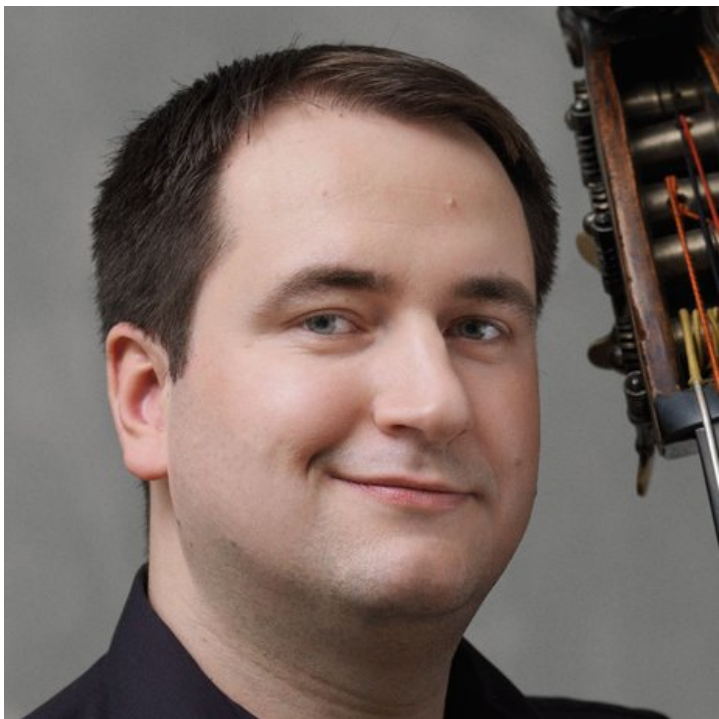
Born in Bielsko-Biała (Poland) Member since 2011-08-31